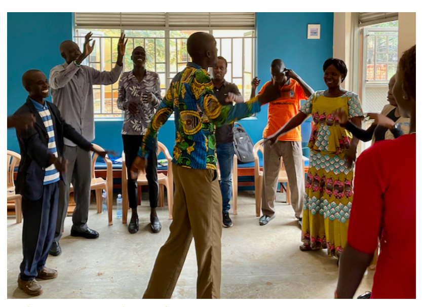
Facilitator meeting in Rhino settlement

"Because of lack of trust, I was like living in my own settlement-while surrounded by communities (many and different tribes) I knew I could not trust and they could not trust me. For many days I could not sleep because I felt not safe-and there is no doubt many people are still like me before I gain from sociotherapy. Here in the training a lot has changed, I can trust and hope with sociotherapy- the wished changes where we can cohabitate will become reality." (male trainee, Nakivale)