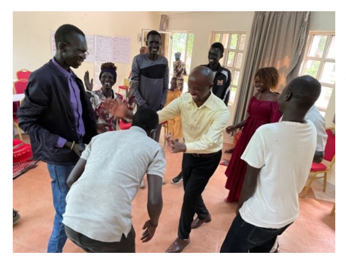
Relax and refocus exercise "greeting the neighbor from the other hill"

Some challenges were experienced by the implementers with regard to administration and logistics. Recommendations for improvements were formulated in the training report, so that the challenges can be appropriately addressed.